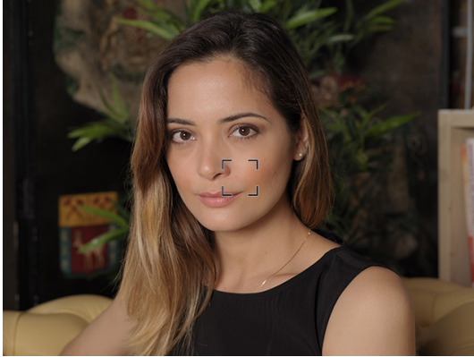
Live View mode in AF mode. Center position.

In the AF function of the X1D, it is possible to select one of 35 points (4 x 4 mm in size) to be used for focusing.